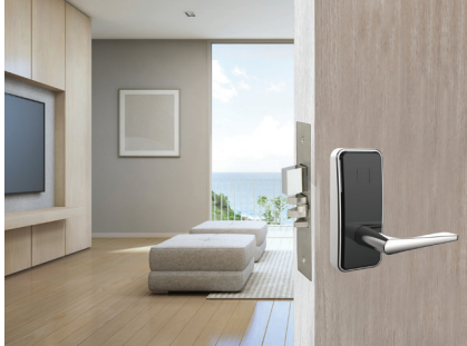
Saffire™ LX Series

Sleek and modern design, with the latest RFID and mobile credential technology.