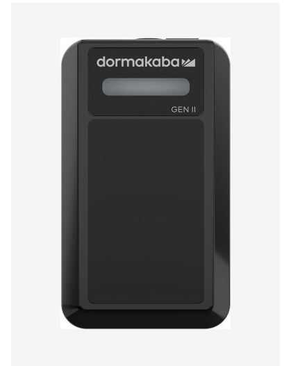
Gen II RFID Encoder—CEIPRF6020

Dimensions: 3.15W x 0.97H x 5.37L inches